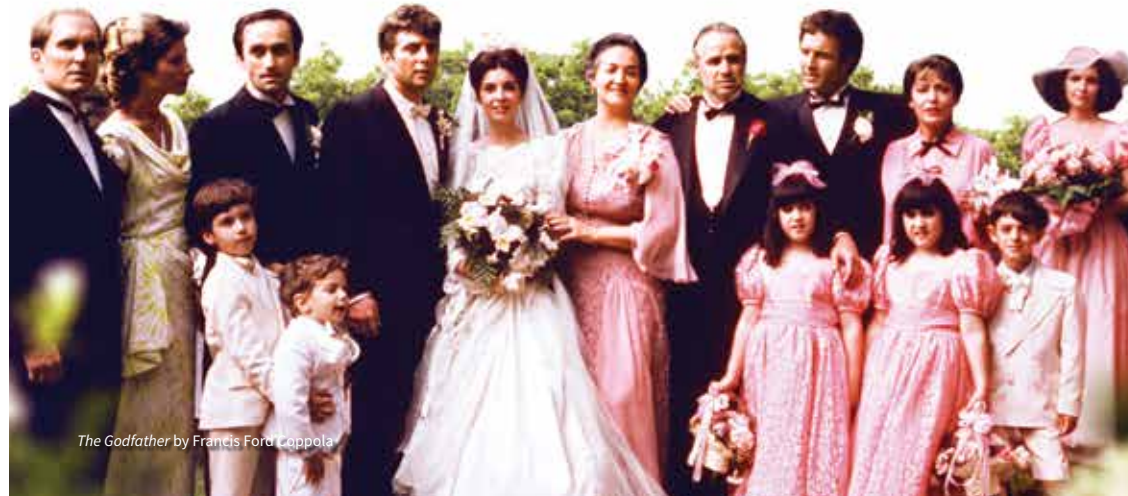
The Godfather by Francis Ford Coppola

Meet the festival's special guests: Frances McDormand, Daniel Auteuil, Bong Joon-ho, Donald Sutherland, Marco Bellocchio, Marina Vlady, Gael García Bernal, as well as Ken Loach, Lumière Award recipient of 2012. Also, Bérénice Bejo will be at the MLIS in Villeurbanne (Saturday, October 19, free entry). Tickets on sale in September.