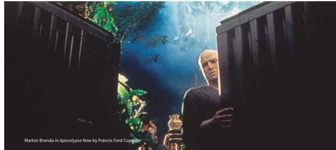
Marlon Brando in Apocalypse Now by Francis Ford Coppola