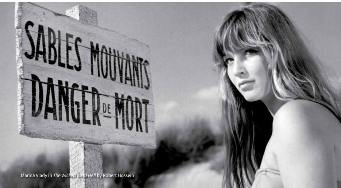
Marina Vlady in The Wicked Go to Hell by Robert Hossein

Since it's never too early to discover the pleasure of movies in a theater, young audiences can laugh out loud at the Halle Tony Garnier with "the tramp" in a film-concert of three wonderful short films by Charlie Chaplin. Another screening event: the new restoration of The Wizard of Oz on the big screen at the Auditorium of Lyon. There will also be short films by Paul Grimault, the beautiful Japanese animated feature Yuki , the classic Swords of Blood by Philippe de Broca and A Bag of Marbles by Jacques Doillon.