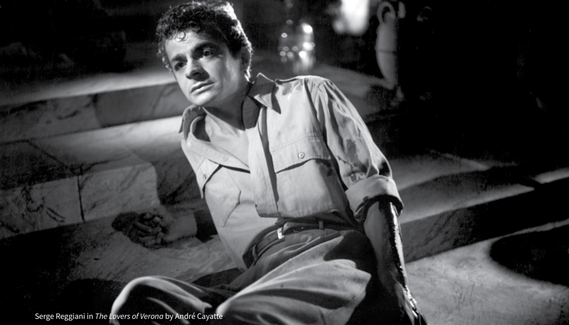
Serge Reggiani in The Lovers of Verona by André Cayatte