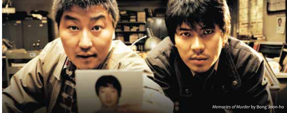
Memories of Murder by Bong Joon-ho