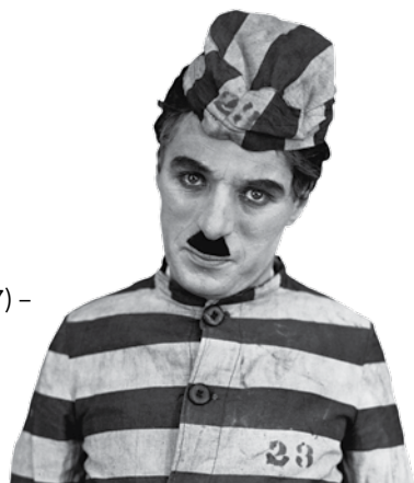
© Charlie Chaplin™ © Bubbles Incorporated S.A.

With entertainment, a free snack and lots of surprises!