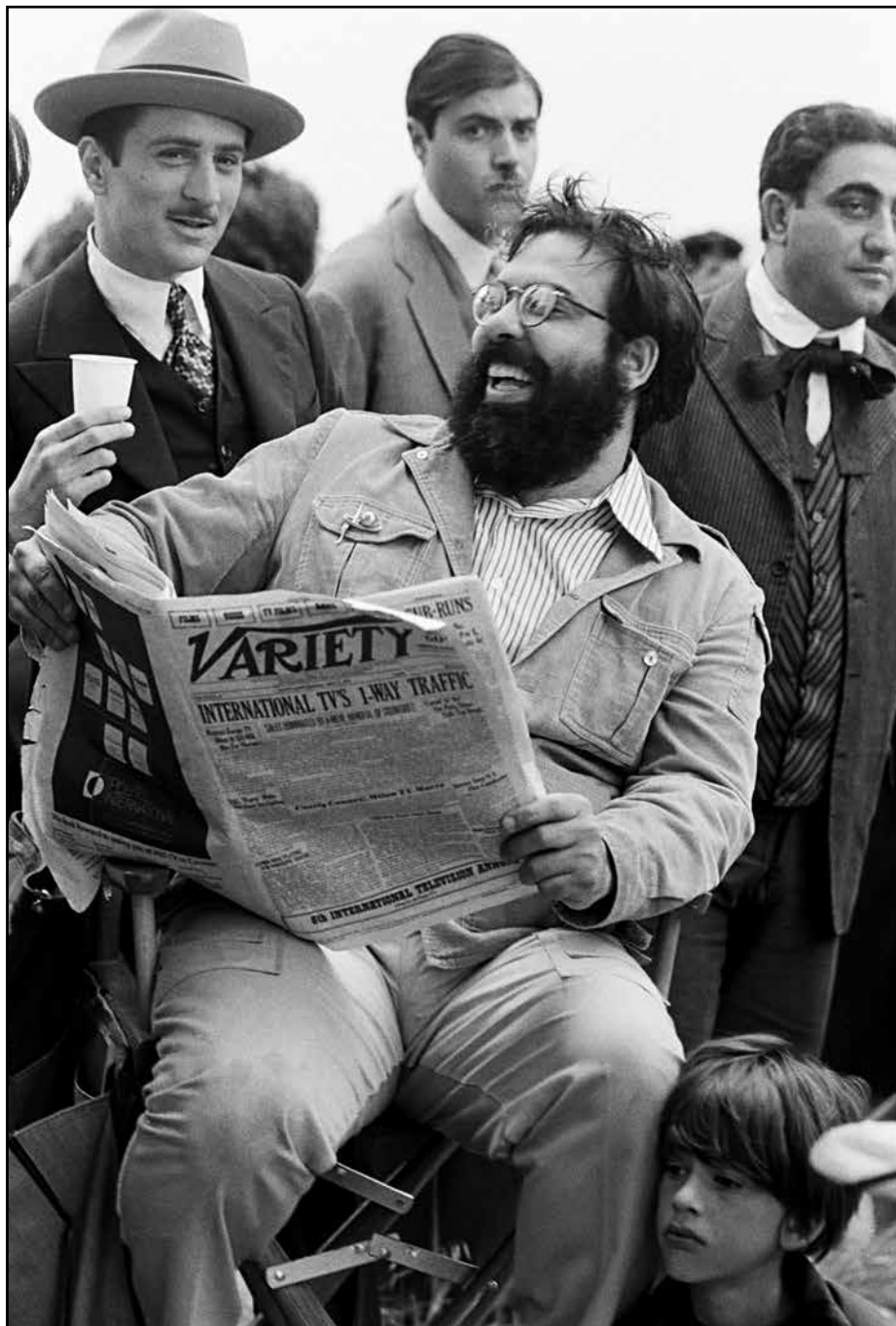
Francis Ford Coppola and Robert De Niro on the set of The Godfather: Part II (1974).

LUMIÈRE2019 GRAND LYON FILM FESTIVAL 12/20 OCTOBRE