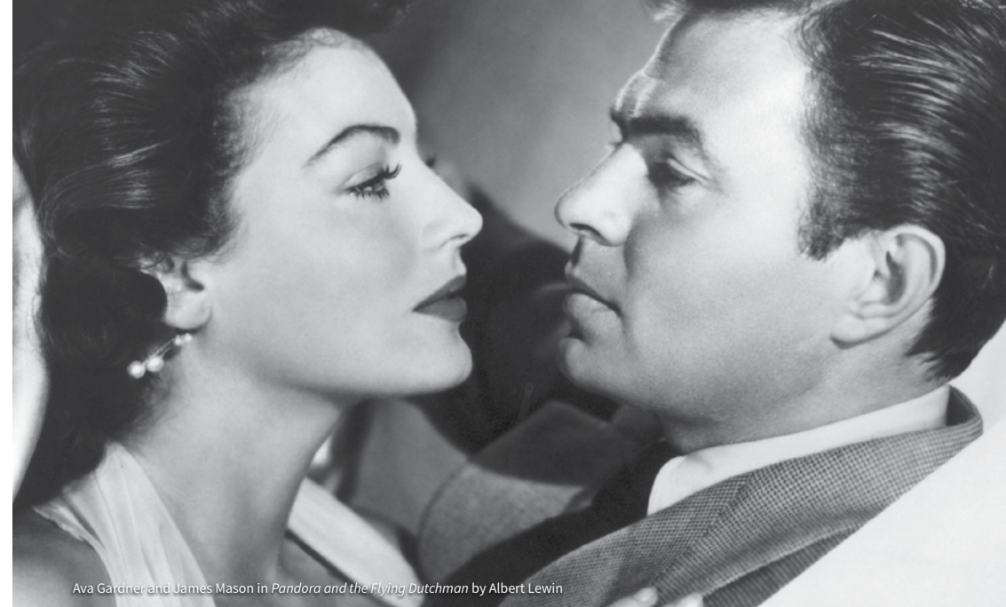
Ava Gardner and James Mason in Pandora and the Flying Dutchman by Albert Lewin