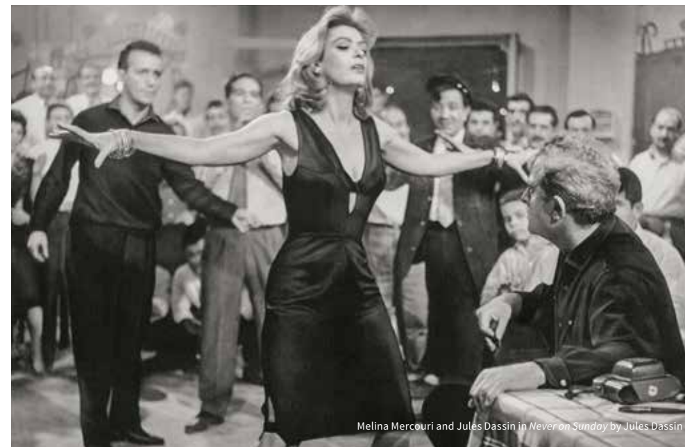
Melina Mercouri and Jules Dassin in Never on Sunday by Jules Dassin

On the occasion of the centenary of her birth, the Lumière festival pays tribute to the Greek actress with effervescent charm, who later became a politician and defender of European culture. The tribute will be led and accompanied by the exceptional Nana Mouskouri.