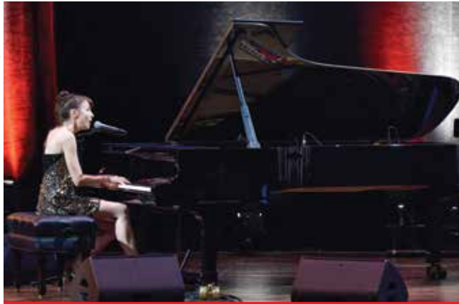
© Collection Institut Lumière / Romane Derbelien - Jean-Luc Mége