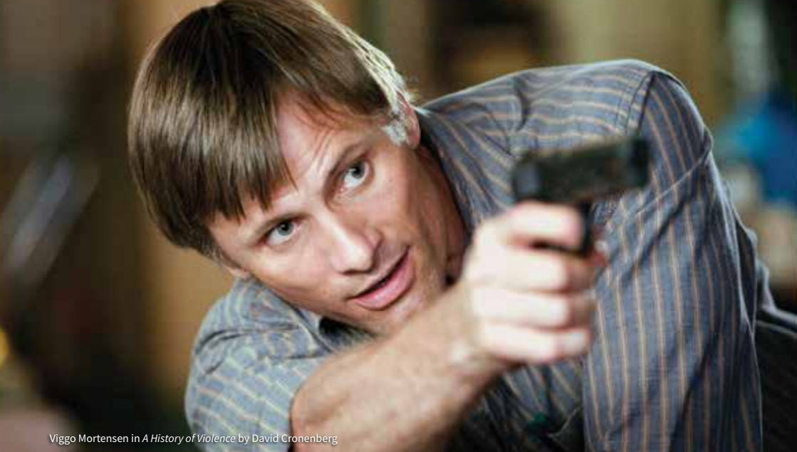
Viggo Mortensen in A History of Violence by David Cronenberg