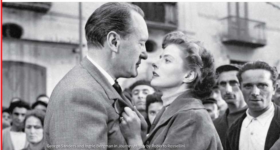
George Sanders and Ingrid Bergman in Journey to Italy by Roberto Rossellini

... Add, subtract, mix & match! Find the synopses of all the movies on pp. 35-46.