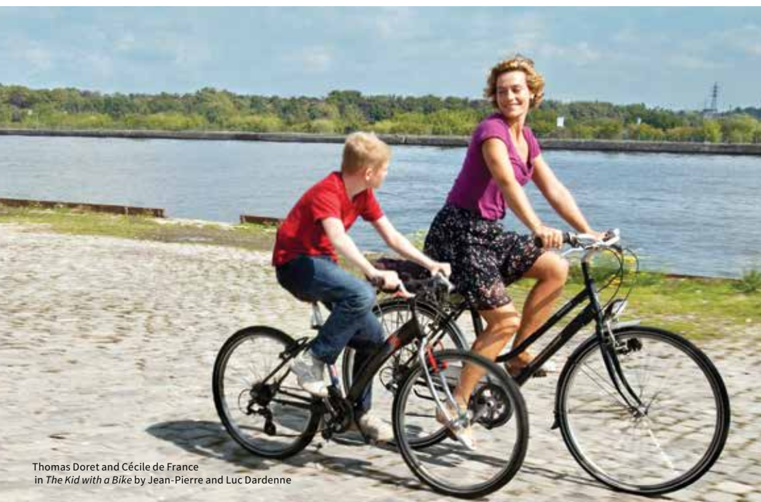
Thomas Doret and Cécile de France in The Kid with a Bike by Jean-Pierre and Luc Dardenne